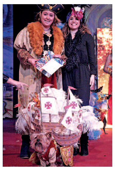
Dressed Up Pet Contest